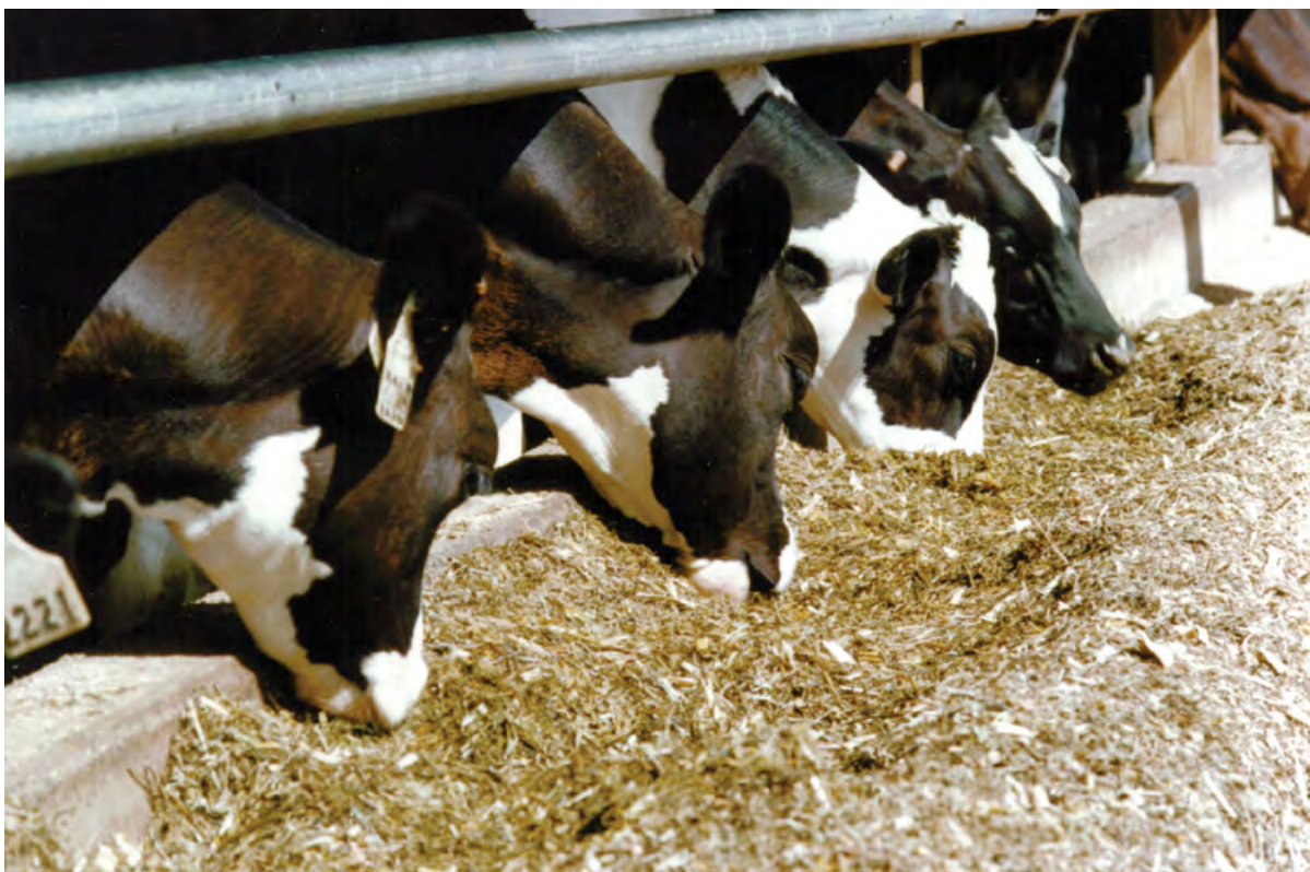
For ruminants, fibre is an important part of the metabolism in the rumen.

estimate of the amount of fibre or plant cell wall. However, in recent years, livestock nutritionists have begun using Neutral Detergent Fibre (NDF), Acid Detergent Fibre (ADF) and Acid Detergent Lignin (ADL) as indicators of dietary energy and intake, especially for ruminant rations. As a result, these fibre fractions have replaced crude fibre (CF) in ration formulations in many parts of the world. Today ADF and NDF values are frequently used to estimate the amount of forage that can be digested by animals; the total digestible nutrients and other energy values, as well as the relative feed value (an index used to allocate the correct forage to specific animal performance) to price hay and to assess forage management, harvest and storage skills.