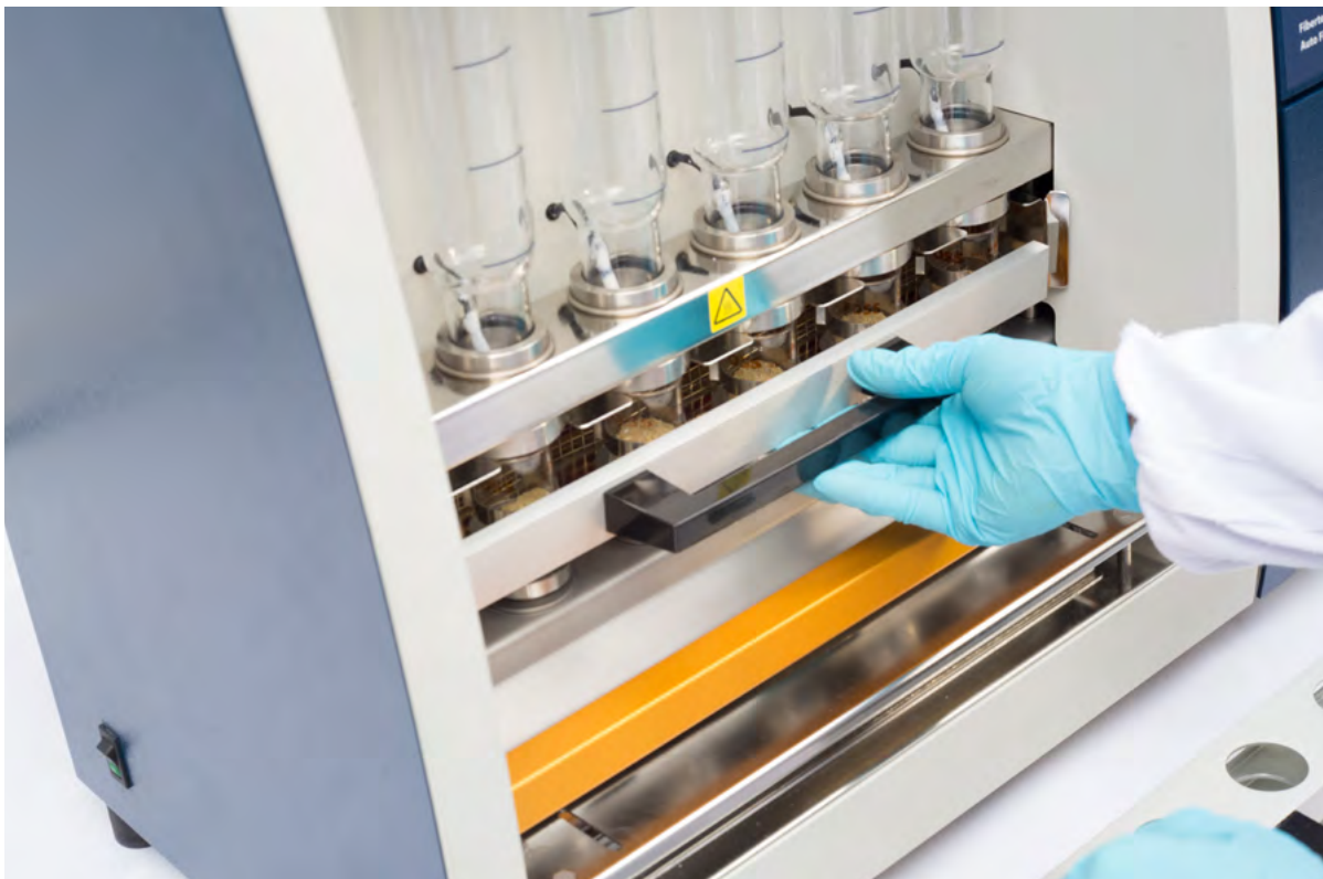
With an automated crucible method, an operator can literally load a set of up to six samples press a start button and walk away.

An operator can literally load a set of up to six samples press a start button and walk away. The actual operator time is as little as two minutes and equipment can even run overnight. For more, see the time savings comparison in chapter 5 and the case story video in chapter 6.